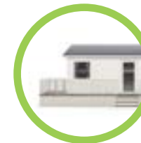
Caravan Holiday Home Lodge