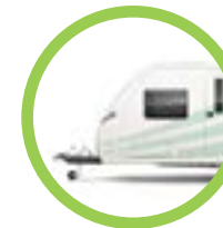
4-6 Berth Touring