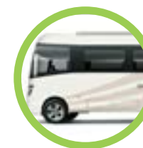
A- Class Motorhome