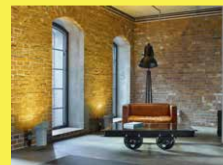
Left: Hamburg is Germany's new go-to city break destination. Above: industrial chic at Gastwerk hotel