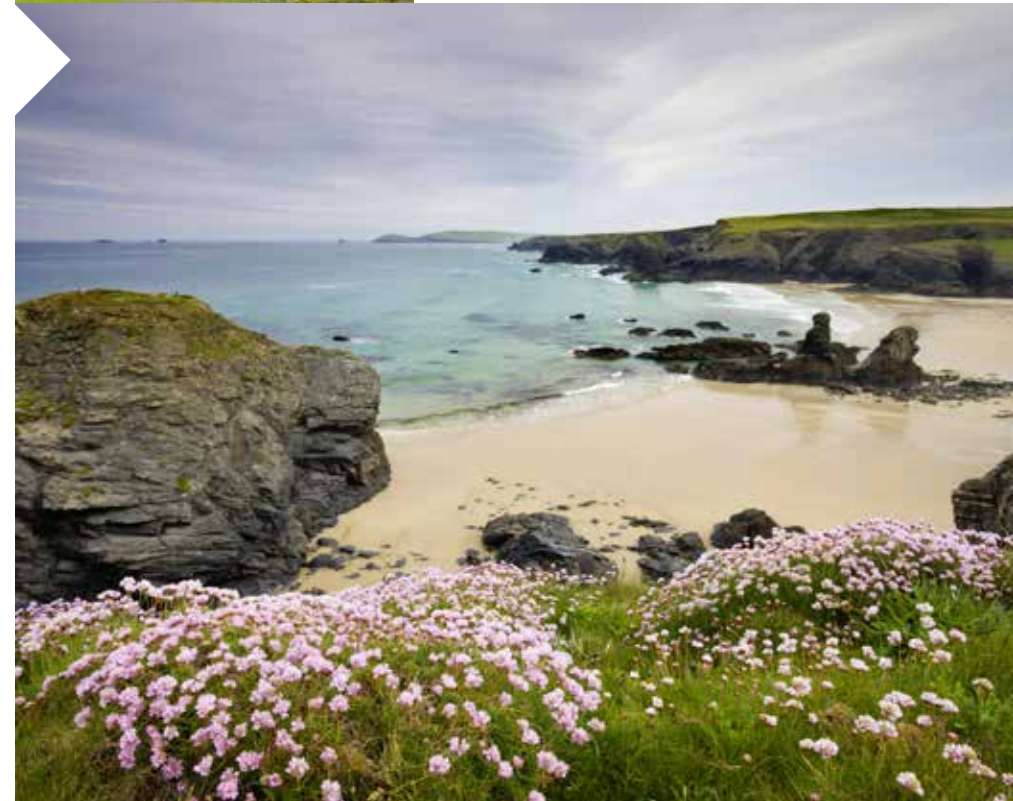
Left: luxury lodges at Hilton Woods Park. Below: the wild beauty of Porthcothan Bay