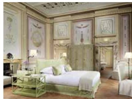
The glorious Tuscan countryside. Right: a deluxe suite at Castello del Nero Hotel

WHERE TO STAY Castello del Nero Hotel & Spa is a converted 12th-century castle that sits atop a hillside with stunning views over the surrounding vineyards and olive groves. The building has been brought into the 21st century but with many historical features restored, such as polished tiles, marble and mosaic bathrooms