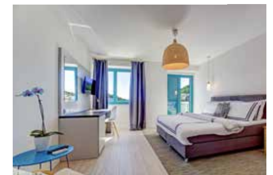
Main picture: the beautiful town of Šibenik. Left and top: the Old Harbour and Old Town of Dubrovnik. Above: stay in the spacious rooms at The Admiral Zaton