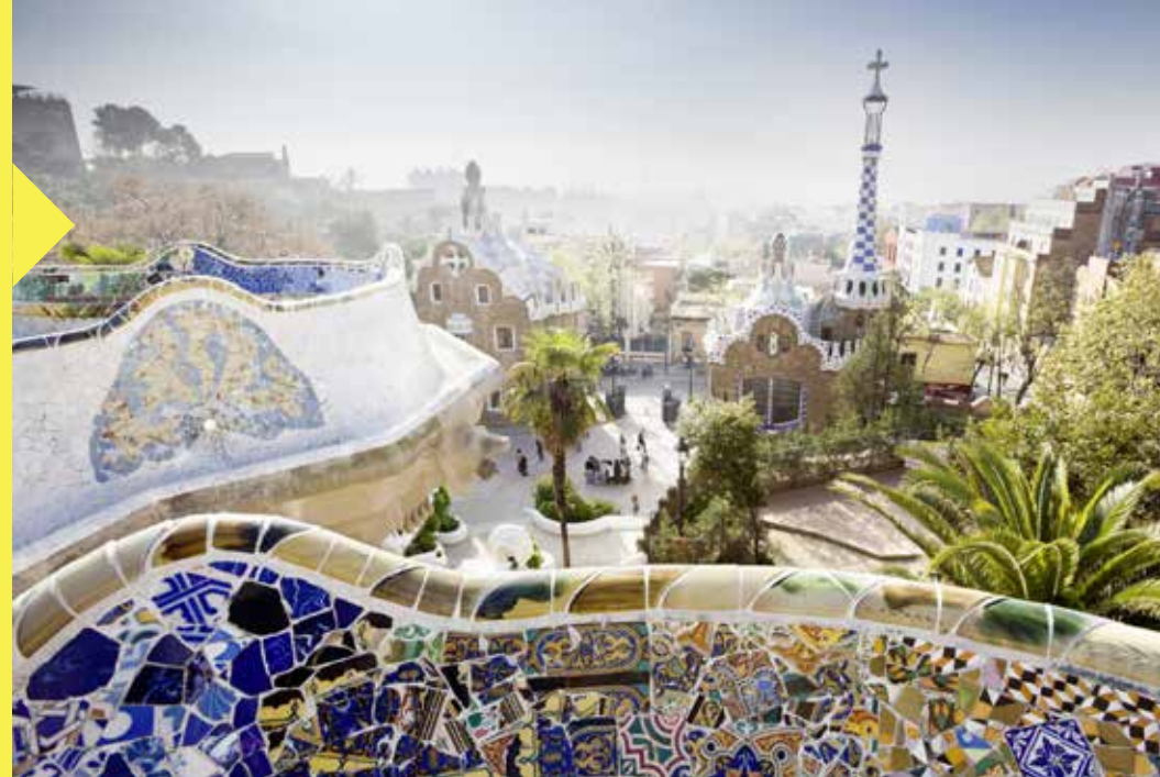
Above: Park Güell and the amazing architecture of Antoni Gaudí. Below: Soho House Barcelona's rooftop pool, with panoramic views over the city