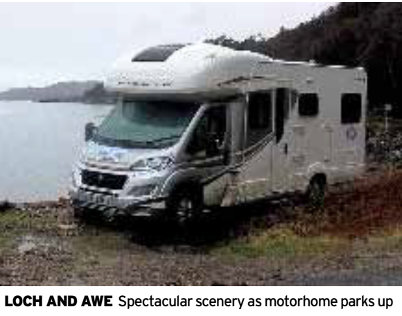
LOCH AND AWE Spectacular scenery as motorhome parks up

Facts ■ Katrina's motorhome and trip was organised courtesy of www.freedomtogo.co.uk . Hire for a week starts at £500. ■ For hire companies and camping sites, call 01342 336944 or go to campingandcaravanningclub.co.uk .