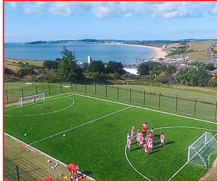
There is a 3G pitch with Arsenal soccer schools for youngsters