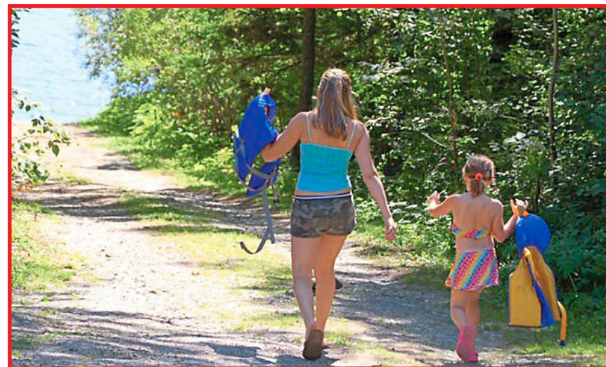
Stunning walks are on the doorstep of Waterside in Weymouth