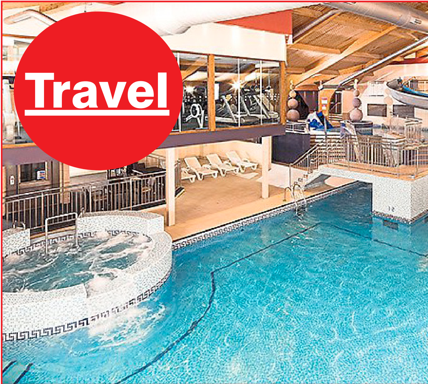
The indoor pool with spa pool at Waterside Holiday Park in Weymouth